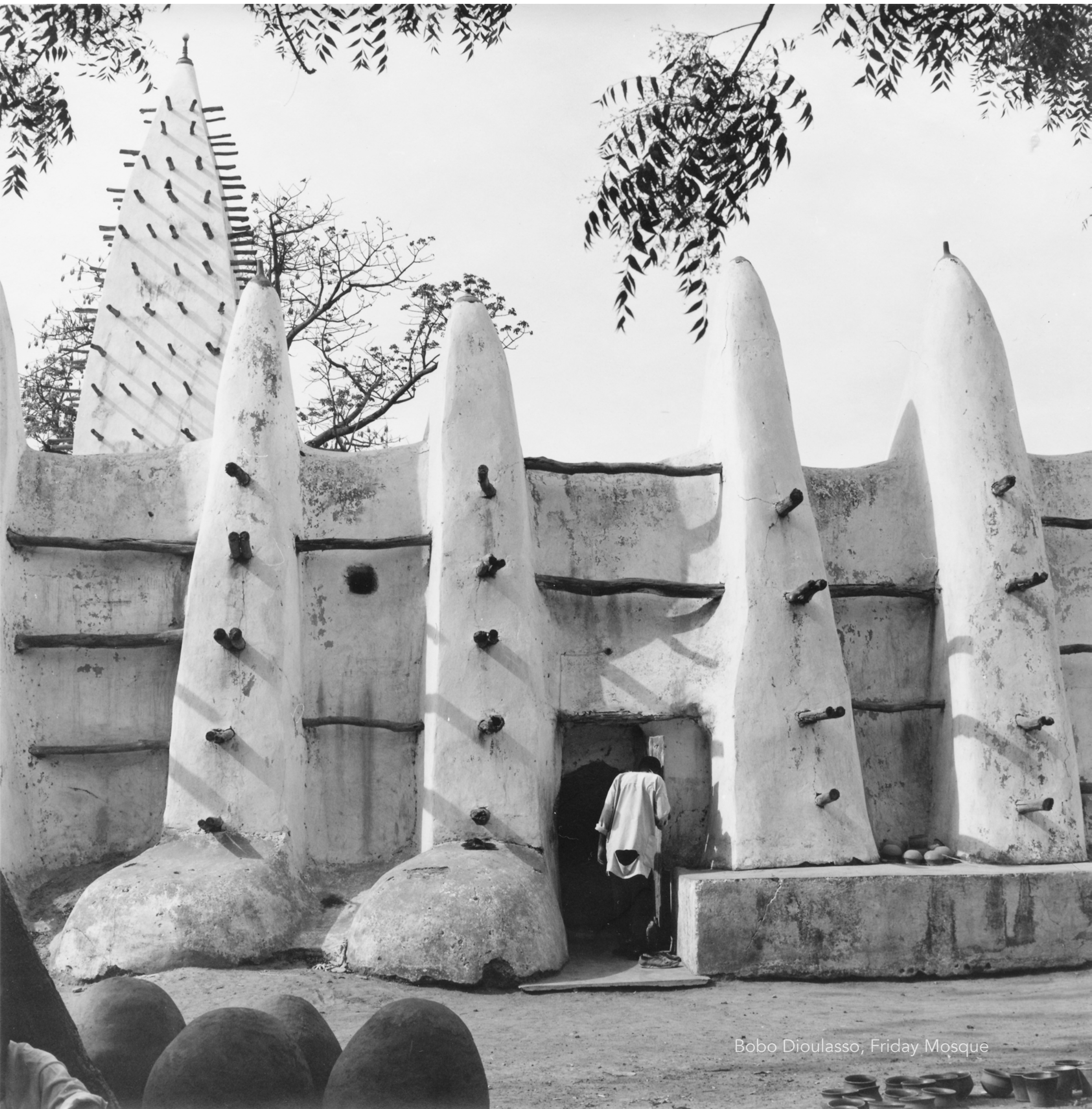
Bobo Dioulasso, Friday Mosque